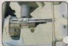
Detachable Wire Resistant Needle