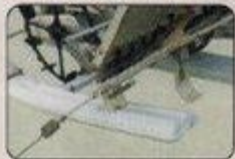
Self Adjusting Float Mechanism