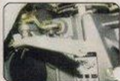
Space Adjustment between Rows