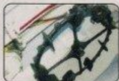
Rubber Lock Wheel