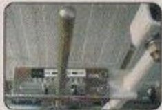
Space Adjustment between Plants

Warranty and after-sales service are available with all Greaves Dealers. Since continuous R&D is undertaken, Greaves Cotton reserves the right to change design and product features from time to time.